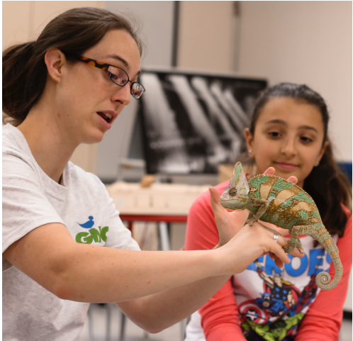
A Cool Career Roundtable on veterinary medicine and animal care had a surprise visit from a scaly friend.