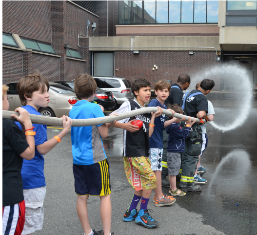
A series of workshops by local firemen taught kids about the science of fire-fighting.